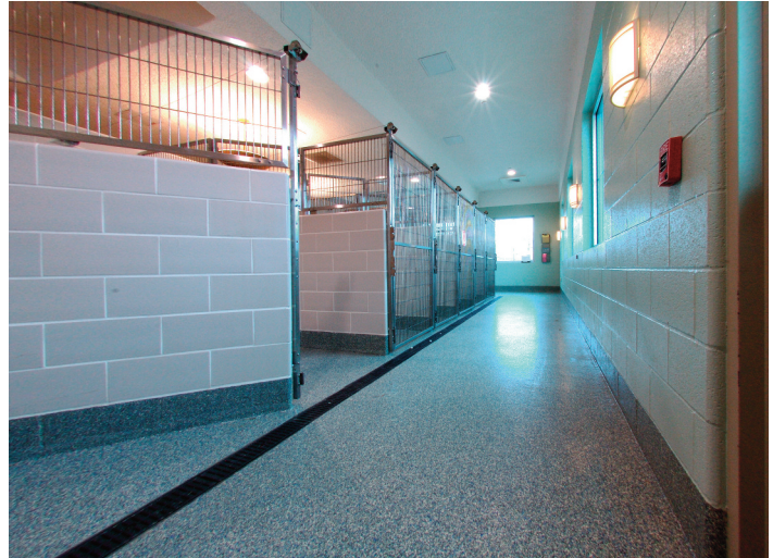
The wash down areas require slip-resistant, easy-to-maintain floors.

The MSPCA, along with the architects made a clear case for monolithic, high gloss and low-maintenance floors and walls for the animal holding areas, adoption viewing areas and wash down rooms. Their objective was not only glossy, easy-to-maintain surfaces, but also a seamless floor graded for drainage and with no visible joints. Stonhard suggested Stontec UTF, an extraordinary urethane system with excellent chemical, stain and wear resistant properties. In addition to addressing all the demands of the new facility, this product is installed with a quick turn-around time and minimum odor,