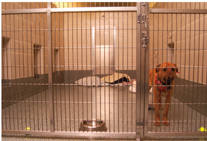
Holding Areas and Kennels are easy to clean with seamless Stontec UTF floors.

The decision-makers and staff at the MSPCA Noble Family Animal Care & Adoption Center applauded the results of Stonhard's floor and wall products. Not only did the products meet and exceed design and performance expectations, but the installation was expedited due to the rapid cure time of the products and with little odor.