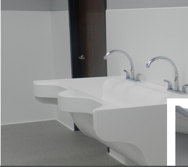
Stonhard top-of-the-line flooring solutions for a one-of-a-kind facility.

Stonhard is the unprecedented world leader in manufacturing and installing high-performance polymer floor, wall and lining systems. Stonhard maintains 300 Territory Managers and 175 application crews worldwide who will work with you on design specification, project management, final walk through and service after the sale. Stonhard's single-source warranty covers both products and installation.