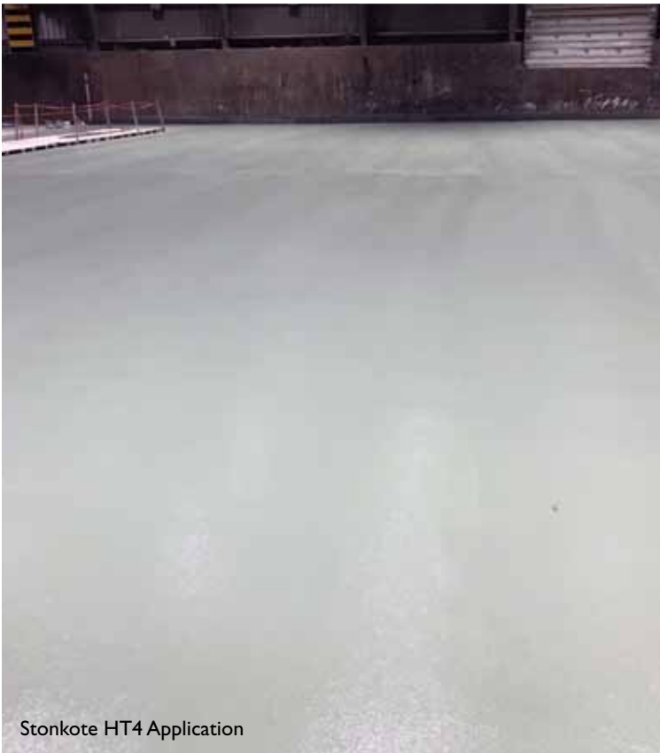
Stonkote HT4 Application

Finally, the saw cuts in the concrete floor were honoured and caulked with a fast curing polyurea material to ensure adequate expansion capacity in the floor.