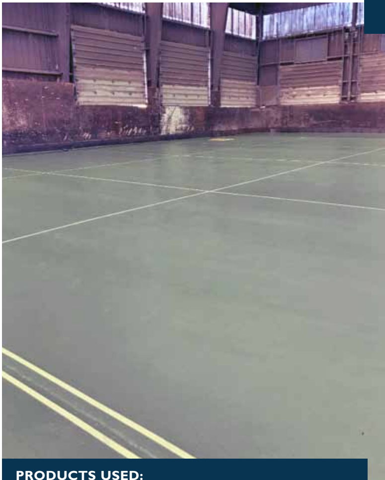
AREA: TIPPING FLOOR