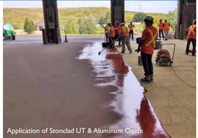
Application of Stonclad UT & Aluminum Oxide