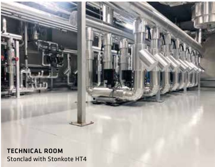
TECHNICAL ROOM Stonclad with Stonkote HT4

Stonhard's broad range of high-performance products and processes are designed to handle the most demanding areas in your pharmaceutical facility and are vetted for the most stringent safety protocols. All our installations are OSHA-compliant so you can maintain peace of mind throughout. Our safety-conscious prep crews work with PPE and HEPA filters, and site safety paperwork is readily accessible to all on-site and off-site personnel to maintain the highest safety standards.