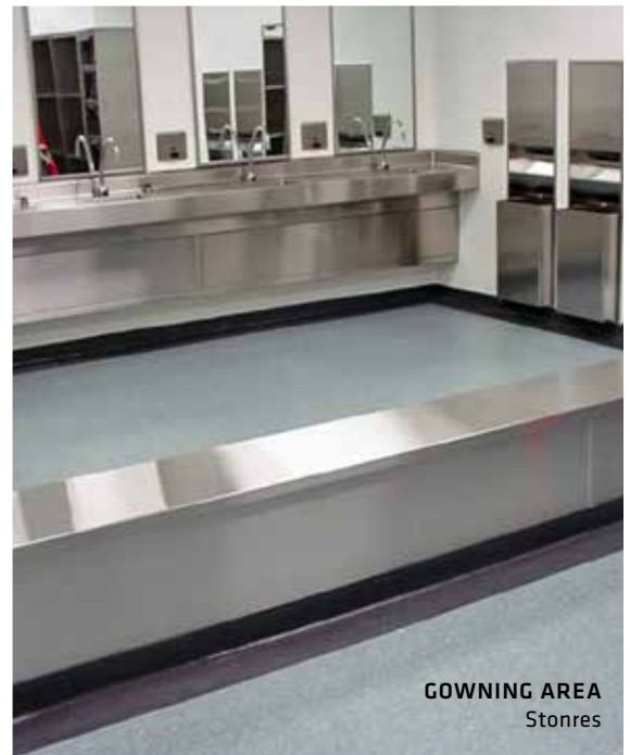
GOWNING AREA Stonres