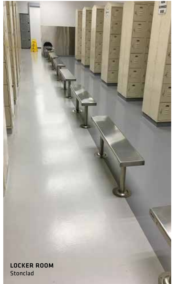
LOCKER ROOM Stonclad

Chemical resistant flooring is designed to stand up to a wide range of harsh chemicals over long periods of time. This type of flooring is one whose functional and aesthetic performance won't degrade with repeated chemical spills or the use of industrial-grade cleaning agents. This allows you to keep important areas 100% sanitary at all times without having to worry about the longevity of your surfaces. They are specifically designed for chemically intensive pharmaceutical environments.